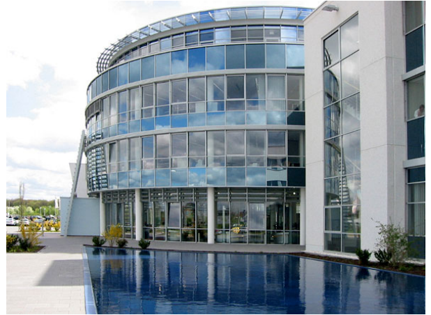
European Haedquarter for Visteon, Kerpen (near Cologne)