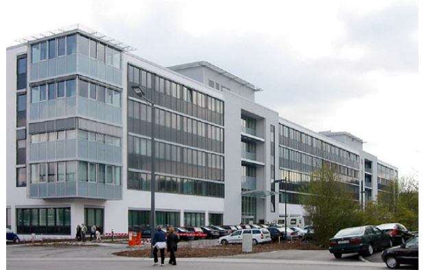
Businesspark, Böblingen (near Stuttgart)

PISKE+PARTNER Architecture and urban design Wilhelmstrasse 30 57518 Betzdorf (Germany)